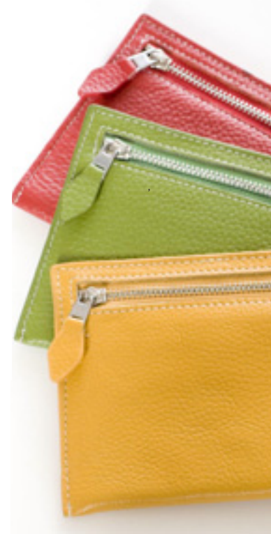
Faux leather clutches have a cardholder inside, $26.