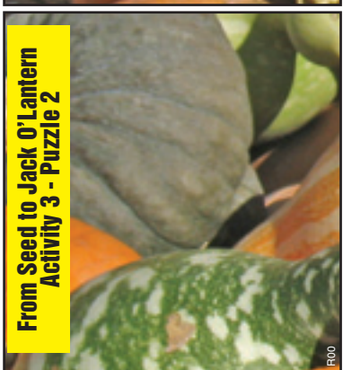
From Seed to Jack O'Lantern Activity 3 - Puzzle 2