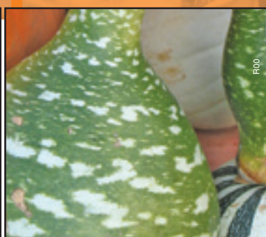
From Seed to Jack O'Lantern Activity 3 - Puzzle 1