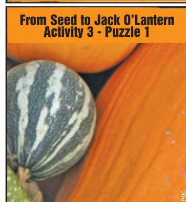
From Seed to Jack O'Lantern Activity 3 - Puzzle 1