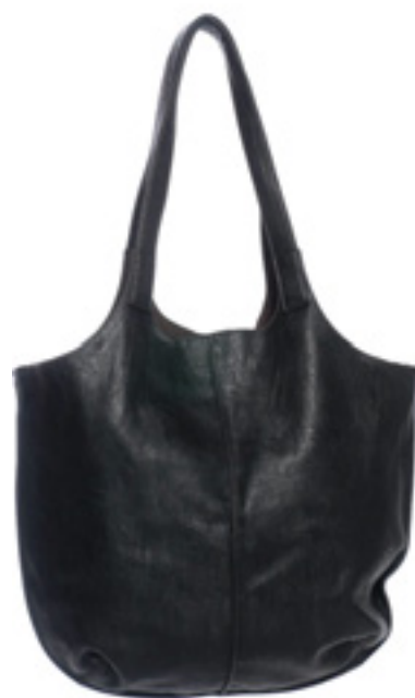
Hyone handbag in leather is $110.