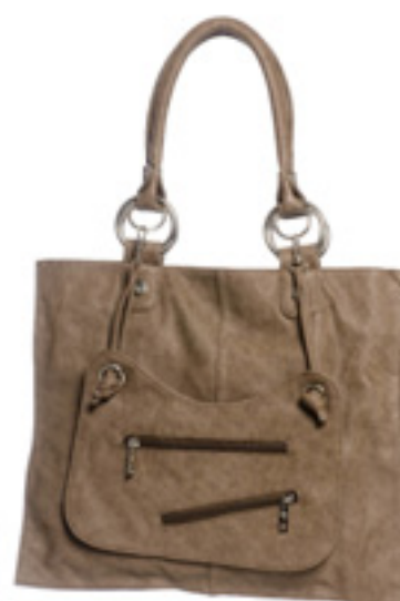
SQ faux leather handbag has a front pocket that can be used as a smaller bag, $24.