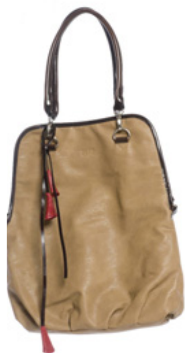
Espe faux leather handbag has removable straps, $64.