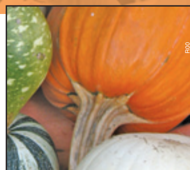
From Seed to Jack O'Lantern Activity 3 - Puzzle 1