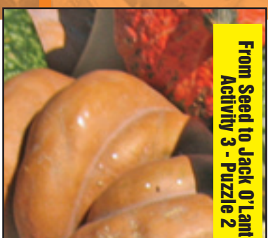
From Seed to Jack O'Lantern Activity 3 - Puzzle 2