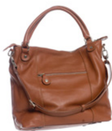
SQ faux leather handbag has smaller bag inside that can be used separately, $65.